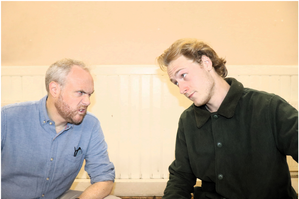
These photos from Imperial Productions Rehearsals show the company (below) and (above) Scrooge meeting a Ghost.

Tickets available at the Budleigh Information Centre open Monday to Saturday 10-1.